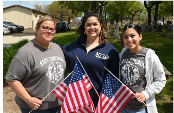
Lions and Leos participated in a Memorial Day Event