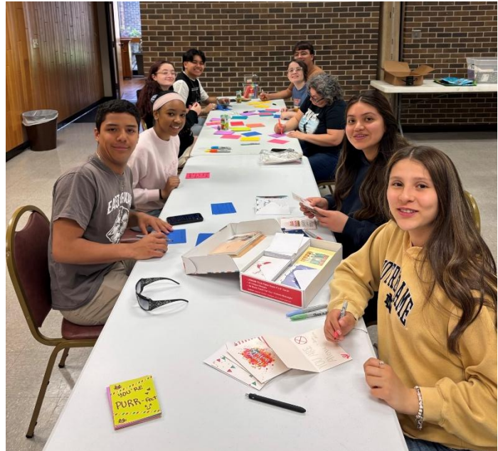
Our Leo's Group created Cards of Hope for Phil's Friends.

Our Values: We are committed to carrying out our mission in a Christ-centered, caring culture dedicated to supporting individuals and families impacted by cancer. We adapt to the dynamic needs of the people we serve by acting responsibly, with a sense of urgency, and a passion for excellence. With integrity, our team serves with compassion, respect, and kindness, offering hope and peace to all.