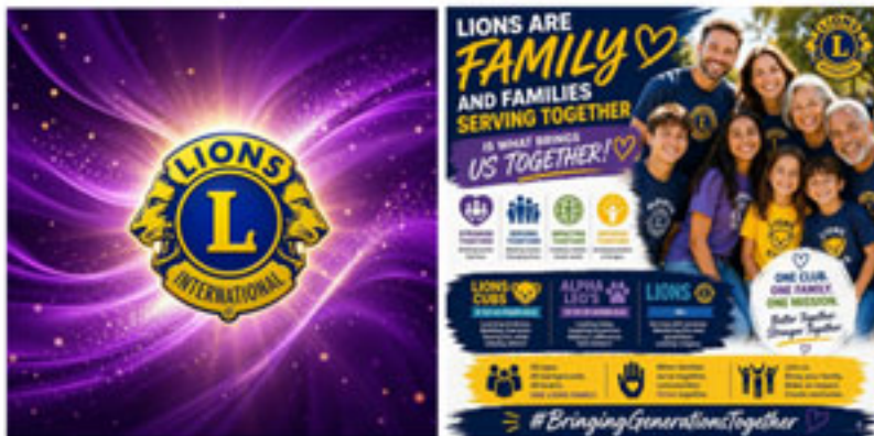
District 25A Lions,

Has channeled its efforts toward matching global initiatives with local impact. Mobilized under his personal rallying cry to “Go & Do,” the district’s long-range roadmap anchors heavily on securing the future of service through youth, expanding core vision programs, and building structural sustainability.