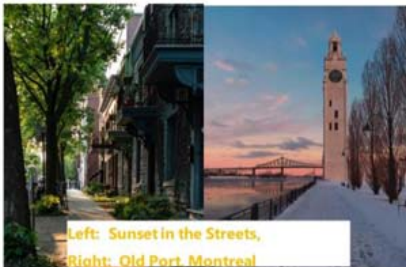
Left: Sunset in the Streets,

Please check out the LCICON website for all the facts and plan on going to Montreal!!