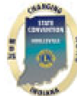
EXHIBIT AND VENDOR APPLICATION