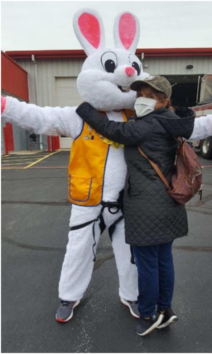
The Lakes of the Four Seasons celebrated Easter with an Easter Lions!