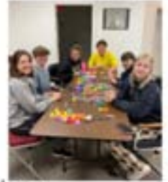
LaCrosse Leo's help at annual LaCrosse Lions Easter Egg Hunt