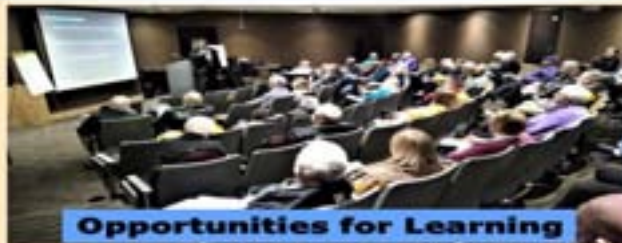
Opportunities for Learning

It's not too early to start planning for 2024. Mark your calendar now for the 2024 Mid-Winter Conference.