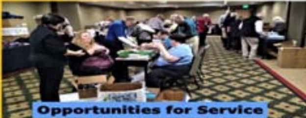
Opportunities for Service

It's not too early to start planning for 2024. Mark your calendar now for the 2024 Mid-Winter Conference.