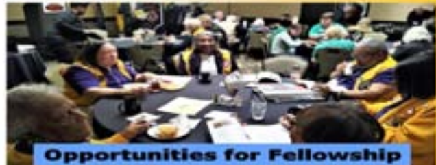
Opportunities for Fellowship

Crowne Plaza Indianapolis Airport January 19-20, 2024