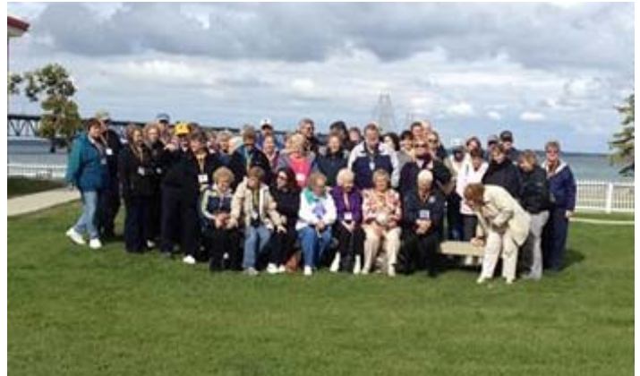
All the travelers at Mackinac Island

See the Flyer on this page for information on next year's trip to Mt Rushmore!