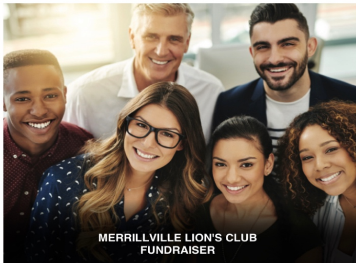
MERRILLVILLE LION'S CLUB FUNDRAISER