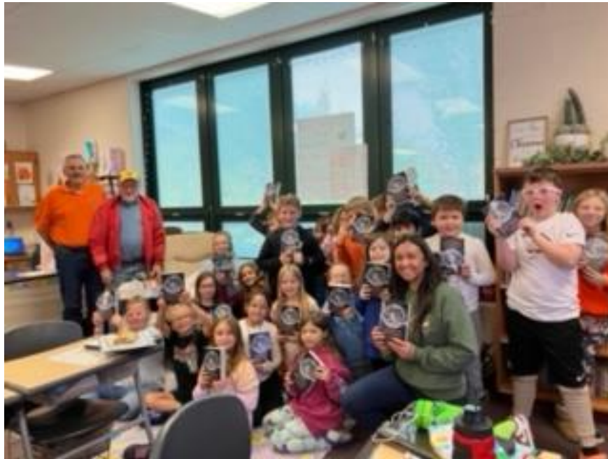
La Porte Lions finished delivering dictionaries to all