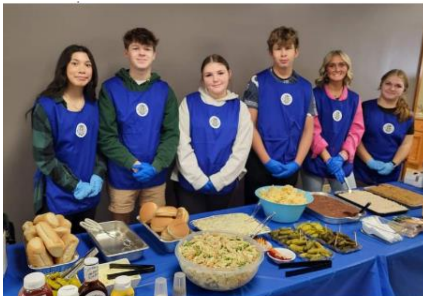
La Crosse Leos did all the serving!