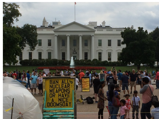
Visitors at The White House