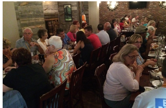
Lions group dining in Washington DC