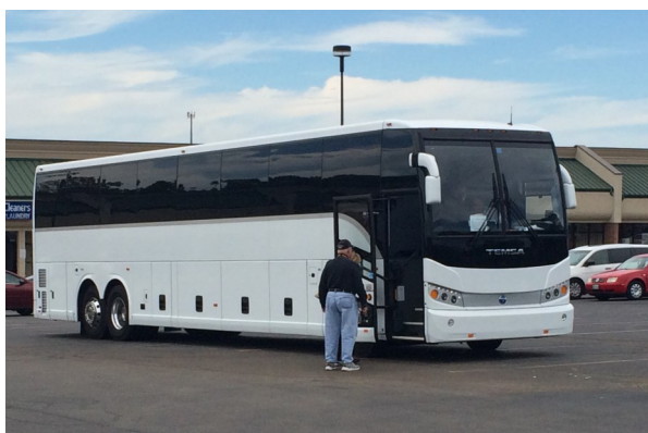
Lion Doug at Bus ready to depart.