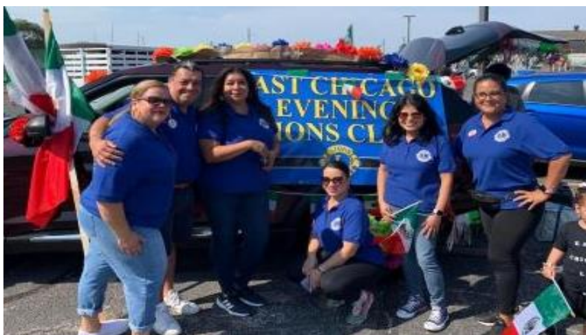
September 15th: Both Lions and Leos participated in the Mexican Independence parade in East Chicago, with its 100th year of celebrating in the city and the oldest celebration in the state.