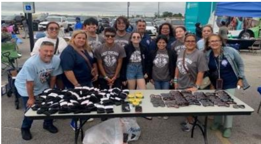
August 6th: Lions and Leos, participated and volunteered at the East Chicago National Night Out.