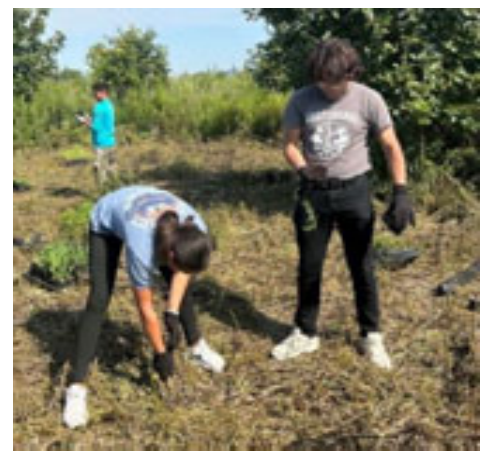
August 24th: Lions and Leos volunteered with The Nature Conservancy to assist in planting native plants to the East Chicago Roxana Marsh.