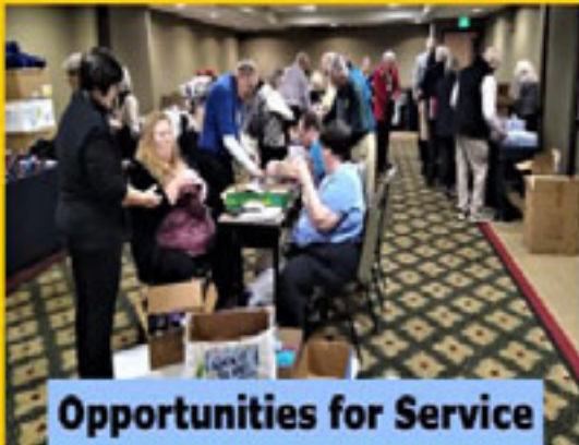
Opportunities for Service

Mark your calendar now for the 2026 Mid-Winter Conference.