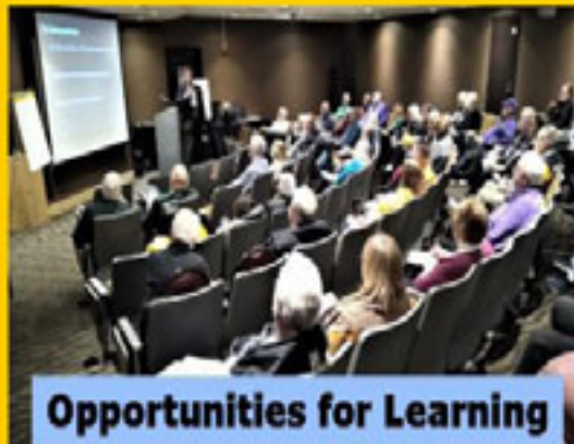
Opportunities for Learning

It's not too early to start planning for 2026.