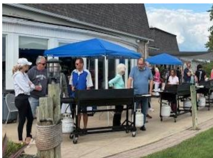
Steaks were grilled on the patio.