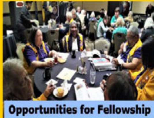
Opportunities for Fellowship

Crowne Plaza Indianapolis Airport January 16-17, 2026