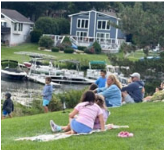
The water show attracted attendees & LOFS residents.