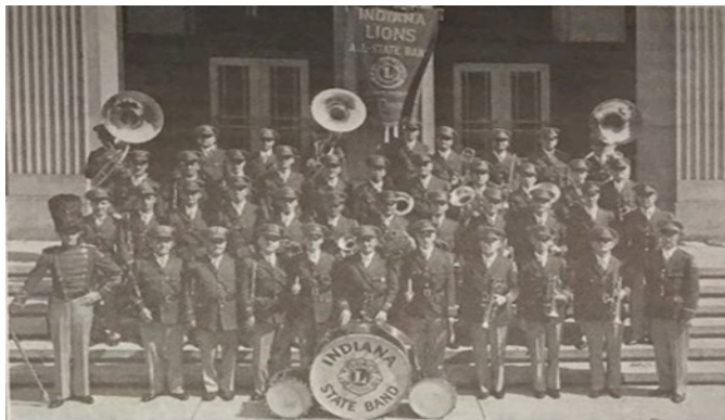
The Indiana All-State Lions band played at the 1934 convention.

“Someone has said that music is a means of expressing man's feeling without words,” said Melvin Jones. “Had there never been human affection, there never would have been uttered a strain of music. Language is not subtle enough, tender enough, to express all that we feel, and when language fails, our highest and noblest longings are translated into music—the sunshine and climate of the soul.”