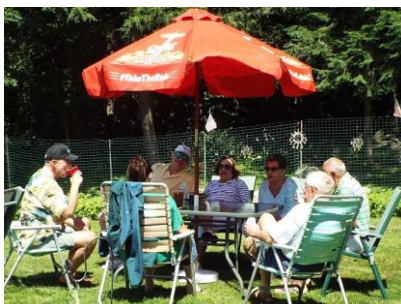
Torrington Lions enjoying the annual club picnic July 29