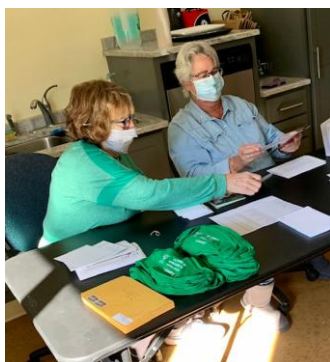
ECAD Lions Club Branch members participated in their second Educated Canines Assisting with Disabilities (ECAD) donor envelope stuffing service project on November 4th.