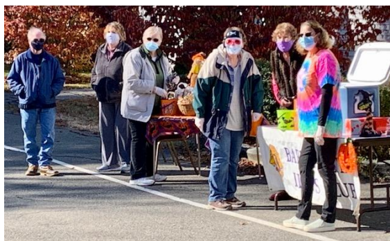
Barkhamsted Lions and Northwestern CT Cyber Lions partnered with the Barkhamsted Senior Center and the Riverton Vol. Fire Department to host a Halloween Drive-Thru for the community where residents drove through the parking lot to get bags of candy, cans of soda and received prizes for best costumes. A fun time was had by all!