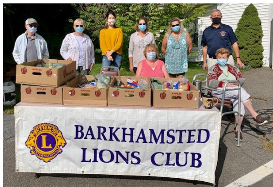
Barkhamsted Lions Club was designated as the Town of Barkhamsted's USDA Farmers to Families food box distribution coordinator and the club has held six separate distribution events with members of the ECAD Lions Club Branch, Barkhamsted Senior Center Lions Club Branch, Northwestern Connecticut Cyber Lions Club and Winsted Lions Club supporting all six events.