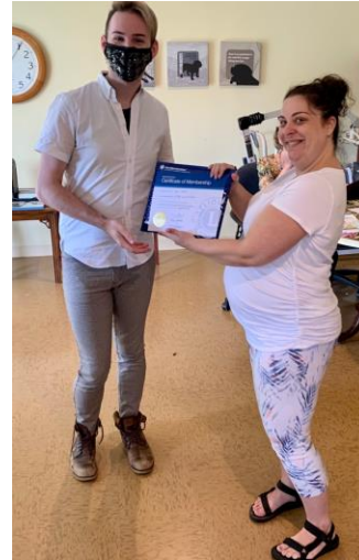
Below, below right: Barkhamsted Lions Club used their District 23-B Membership Grant to sponsor an Open House at ECAD in Winchester CT. Yard signs were produced for the event and 3 new members were recruited. Over 200 folks attended the event and the event generated over $3,500 for ECAD.