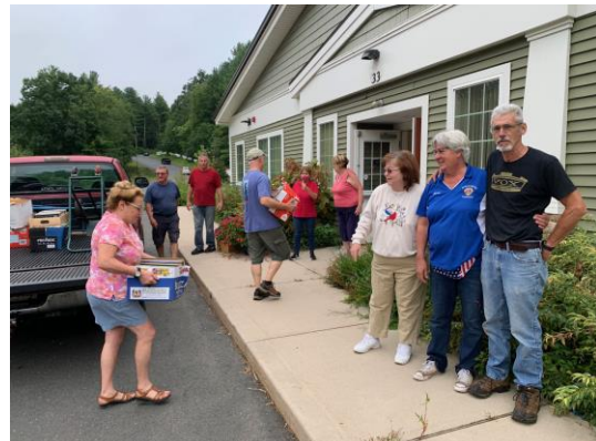
Right: Barkhamsted Lions Club again supported the Friends of Beardsley and Memorial Library book sale fundraiser in Barkhamsted. Members from both Barkhamsted Lions and Northwestern CT Cyber Lions and Leos helped on both days of the event which raised over $5,000.