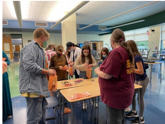
Left: Swift LEOs make goody bags