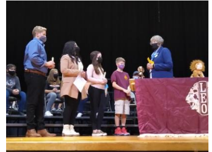
Above: Installation of Swift LEOs

Happy Holidays everyone and thank you for all you do.