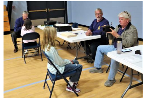
Right: Marlborough Lions perform vision screening