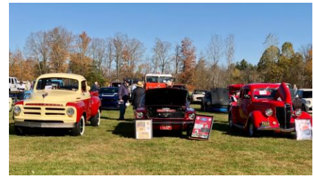
Above: Litchfield Lions Car Show 10/22/2022