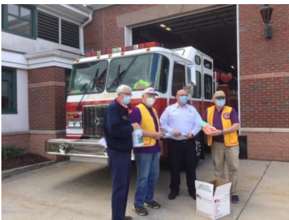
(Above) Manchester presenting PPE to their Fire Responders (Below) Canton donated PPE to their police department. NBC Connecticut filmed the presentation.