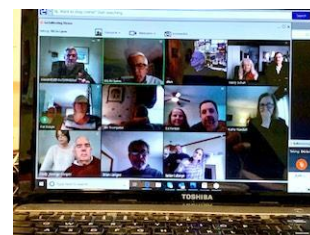
A sample of what virtual zone meetings look like