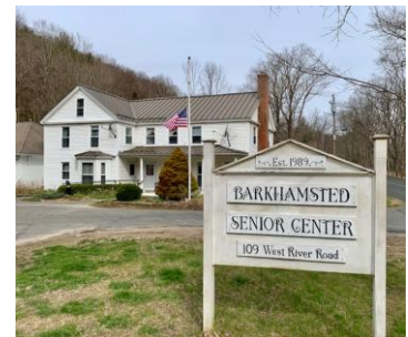
Barkhamsted Senior Center where new branch club will meet.