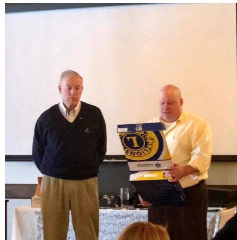
(Left) The Litchfield Lions Club recognized their longest serving members.