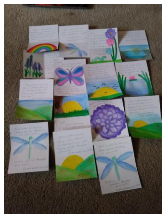
A sample of the cards made by the Windsor LEOs

In these unprecedented times the spirit of "Leos Serve" shines through. Lifelong lessons are being learned as we figure things out while working together to serve our community.