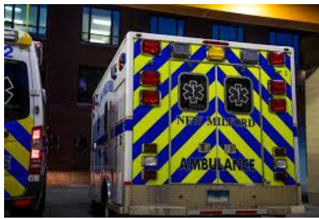
(Above) New Milford donated masks, gloves and disinfectant to their local Ambulance Association (Below) Windsor Locks ready with their donation of PPE