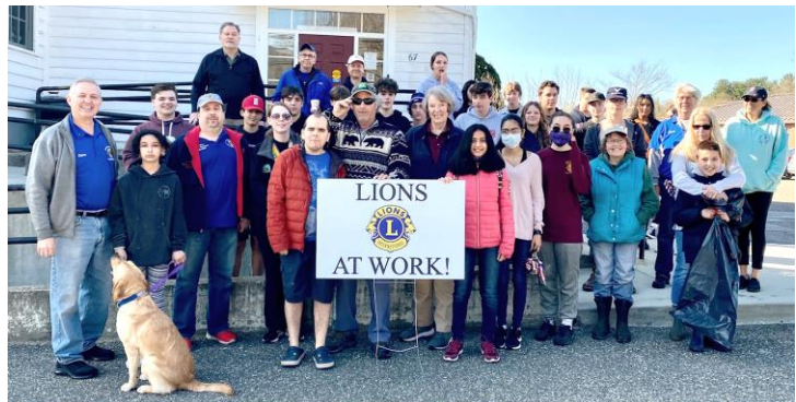
Below: Some of the many participants in the Barkhamsted Lions Farmington River cleanup.