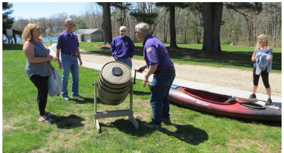
Below: Marlborough Lions pulling the lucky winners for their Kayak Raffle.