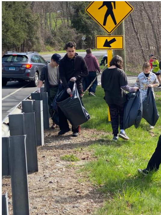
Left: The Barkhamsted Lions, with a lot of help, cleaning up along the Farmington River. Over 500 pound of trash was collected.