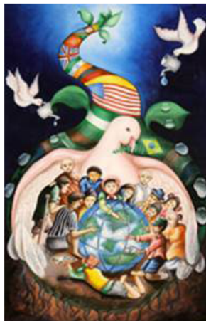
"Our World, Our Future" 2013-14 Grand Prize Winner

Sponsor the Lions art contest for kids in your community through your local schools or organized, sponsored youth groups