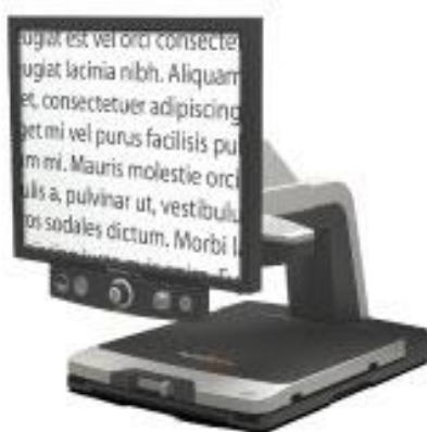
A typical CCTV Reader

One of the products available for those with low vision is a Closed Circuit Television Reading System, also known as an Electronic Magnification Reading System. It's a