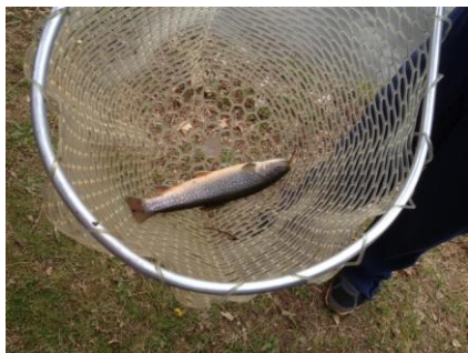
You should have seen the one that got away