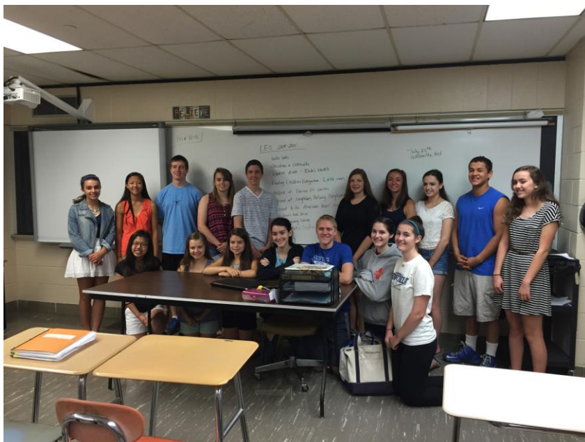
Canton LEOs gathered around their hefty list of 2014-2015 accomplishments. This year promises to be even stronger!