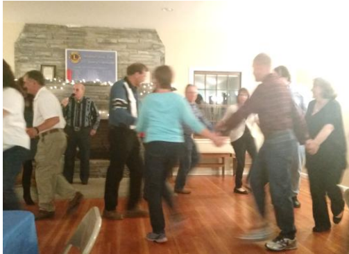
Some of the participants at the April Hartland Lions Club Square Dance

Each July, Hartland Lions work the fried dough booth at the East Hartland Volunteer Fire Department Carnival, and this year was no exception.