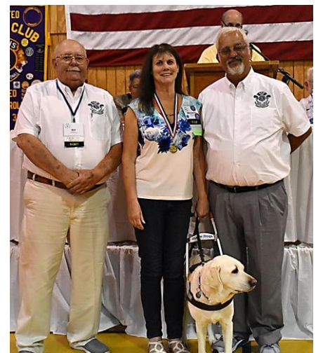
(above) A sample of pictures taken at the 2017 VIP Fishing Tournament