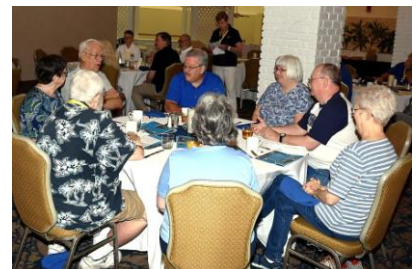
Lions enjoying breakfast.