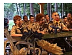
Boy Scout Troop 58 picnic 2016

More at https://www.facebook.com/nm.lionsclub/