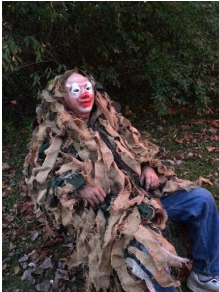
A ghillie ghoul taking a rest between scares at the New Milford Haunted Trail

Several town non-profit organizations joined forces to create a 45-minute Haunted Trail in the woody, dark, dank river banks of the Still River bordering Harrybrooke Park. The event ran Friday and Saturday nights, the second and third weekends in October. Each of the separate organizations created its own scene of fright and mayhem to entertain apprehensive groups of 12-15 people (those not faint of heart or under the age of 12). The event attracted 4,000 visitors and admission proceeds were divided among the participating non-profits. It was a horribly fun time!