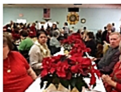
Senior Christmas Party 2016

For 88 years our club has served our community with projects supporting youth programs, vision health, the environment, and eliminating hunger.