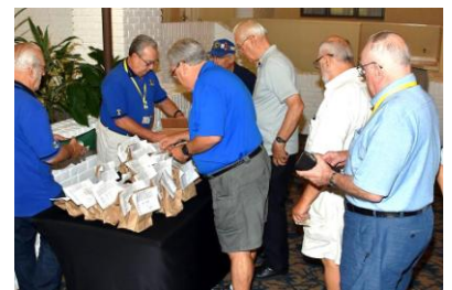
Several Lions getting their breakfast pins