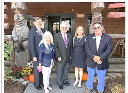
CT Lions did another great job supporting CRIS Radio last year. We donated $40K+ which represents more than 8% of their annual budget.