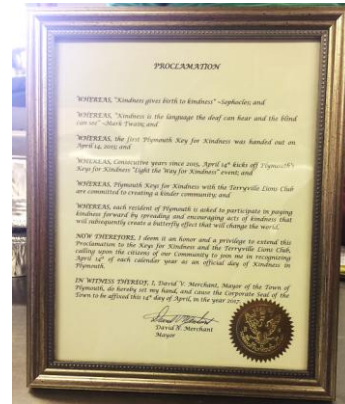
(above) The proclamation presented to the Terryville Lions denoting April 14th as "Kindness Day"