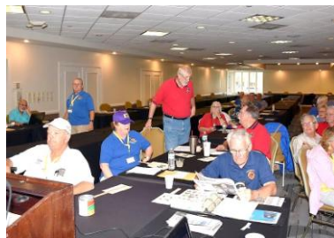
Lions at the Thursday Auction