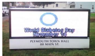
Plymouth Digital Marquee announcing "World Diabetes Day"