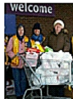
Stop and Shop Food Drive 2017