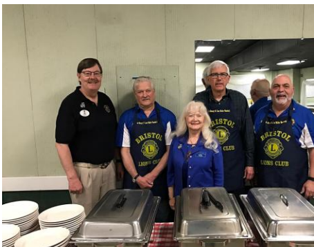
Above: Lions Clubs are known for two things: Service and Pancake Breakfasts. The Bristol Lions held their 2019 Pancake Breakfast on Palm Sunday .