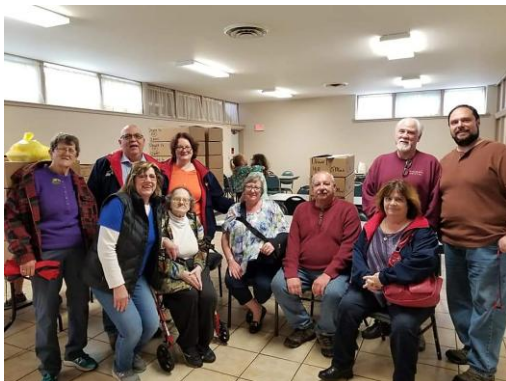
Bristol and Terryville Lions delivered meals to local shut- ins from the Zion Lutheran church soup kitchen in Bristol.