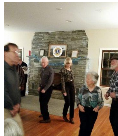
Dancers at the Hartland "Fun Night"

Enjoy our Spring gardens and the return of the birds.