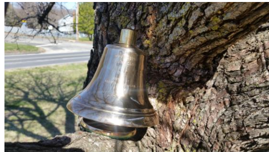
One of the many sightings of the missing bell. It appears to be in good health, but for how much longer?