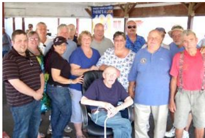
Past Presidents of Terryville Lions