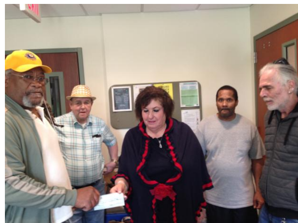
Below: Rocky Hill Veteran Lions Club presenting food and check to Human Services.