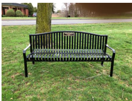
The Rocky Hill Lions Club donated a bench to the town to celebrate 100 years of Lionism.