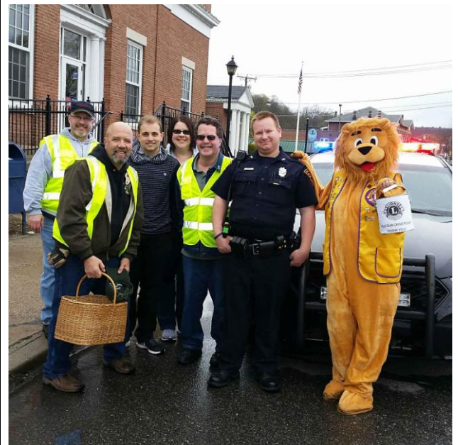
The Thomaston Lion with club members handing out trees at Center School for Earth Day.