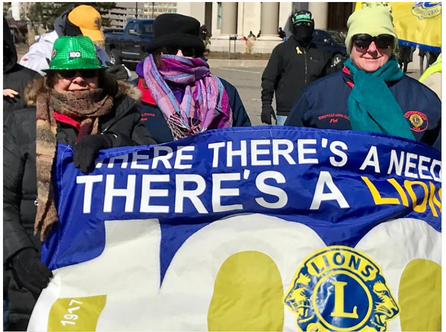
Approximately 20 Lions braved the cold frigid 20 degree weather to March in the Hartford Saint Patrick's Day Parade.

Calling all Moms - By the time this newsletter reaches you we will have had another successful Mother's Day Breakfast. Eggs, pancakes with Hartland's own maple syrup, fresh fruit, pastries and most of all - good fellowship and a big THANK YOU MOM for all you do. We send our best to all the local LIONS Clubs - keep SERVING.