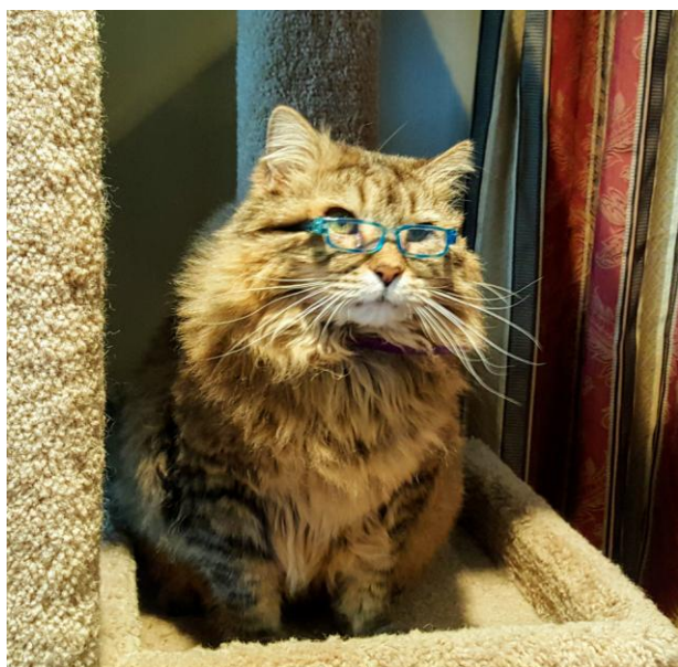
The Windsor Locks Lions Club is proud to present Bailey, sporting a pair of eyeglasses. He is actively promoting eyeglass donations in our town. The club has collected over 500 pair since March of 2016!