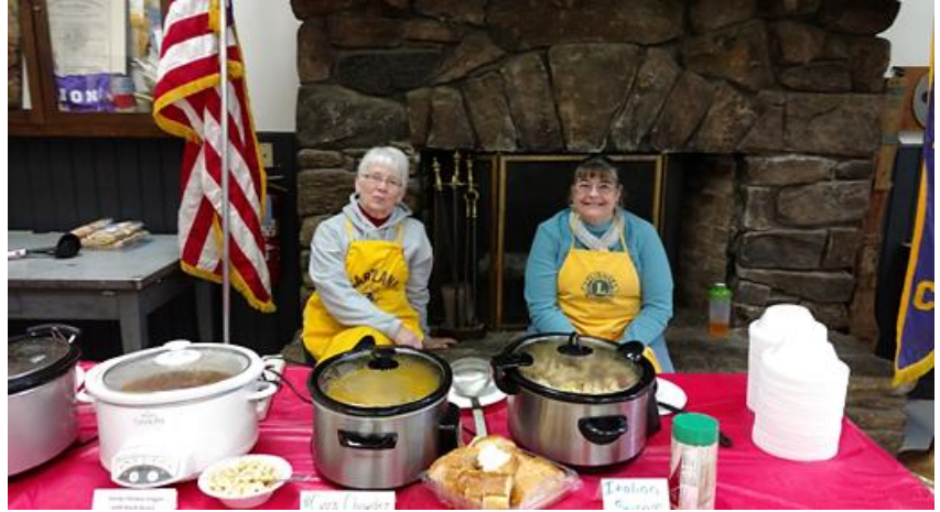
Soups on! Members of the Hartland Lions Club ready to ladle out their offerings at the club's annual Soup and Sandwich event.

So on to SPRING, Arbor Day tree planting, and all else that comes with this welcome change of season. ENJOY!