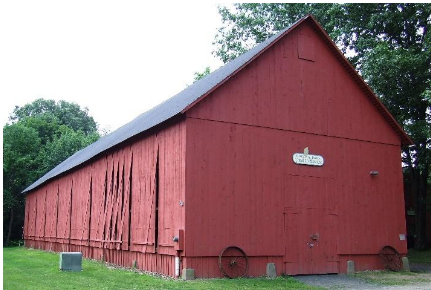
One of the existing tobacco curing barns at Northwest Park was remodeled to accommodate exhibits of early and modern equipment used to grow the crop.

The Woodbury Lions Club looks forward to another productive year, serving the community, and is continuing to attract new members to the group—so far in the 2016-2017 year, we've brought in six new members and there are more coming.