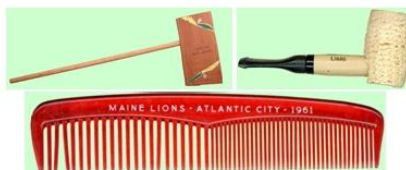
Early Trading Items

In the early 50's most Lion members were still in the United States and they saw a need to give away or trade to others something at the International Conventions that helped promote their home state. In a lot of cases these items were obtained from their State Chamber of Commerce and were little knick knacks that were give-away to help promote their home state. These items could be combs, knives, letter openers or most anything. New Mexico made a wooden Tomahawk and a pair of beaded slippers to celebrate their Indian Heritage. A shoehorn and wooden key chain were from North Carolina. A corncob pipe was from Missouri and the telephone dialer was from Kentucky. A bale of cotton came from Tennessee. It is easy to see that these items were bulky and had to be hard to carry in any kind of numbers. Most pin traders today usually have at least a hundred pins with them, and some with many, many more. You can see that it would be unwieldy to carry a hundred of the cotton bales or a hundred Tomahawks to Conventions.