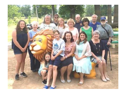
Members of the New Britain Lions Club trving out their Centennial Bench in Walnut Hill Park.

Our New Britain Lions Club recently (June, 2018) donated a Centennial Lions Bench in New Britain's famous Walnut Hill Park. The mayor and other officials attended for the ribbon cutting. The bench adjoins a newly constructed playground and provides parents with a comfortable and attractive place to watch their little ones. A commemorative plaque will be added at a later date.