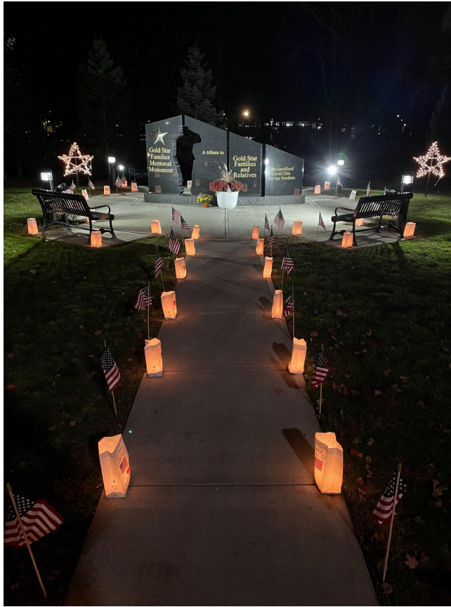
Berlin Lions Christmas Tree Walk