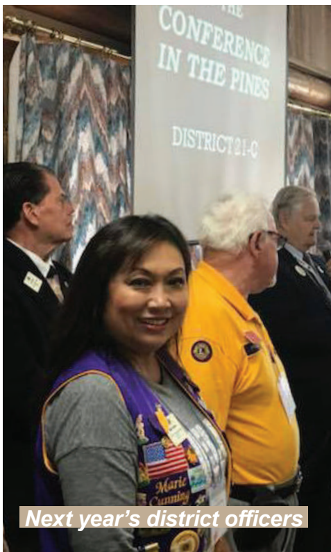
Next year's district officers