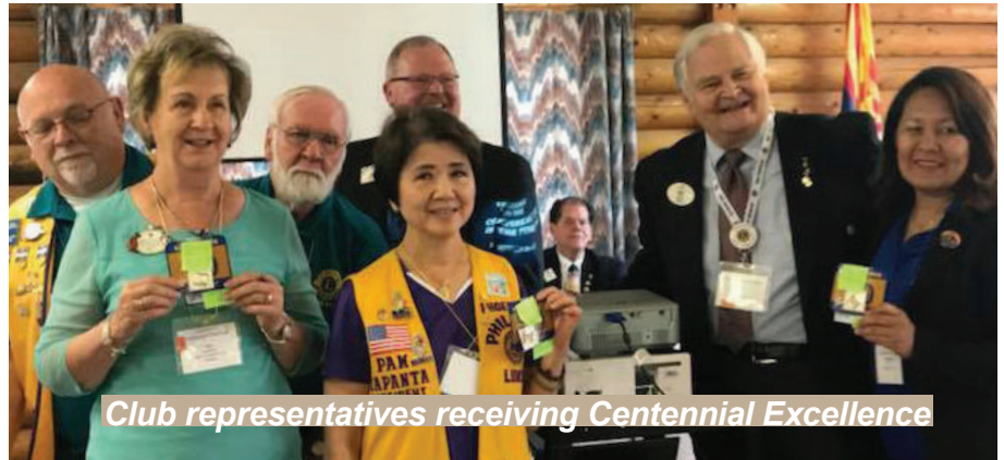
Club representatives receiving Centennial Excellence