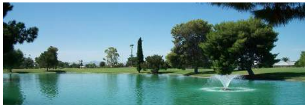
Palmbrook Country Club Golf Course