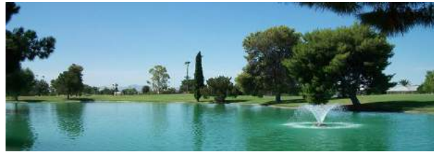
Palmbrook Country Club Golf Course

Join Us on April 21, 2018 for fun, food and golf!