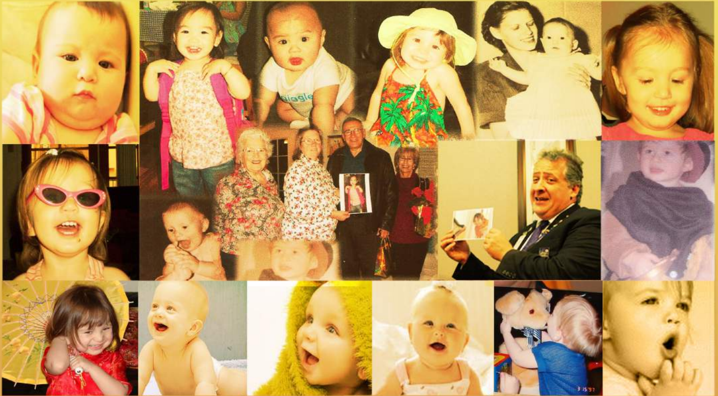
Photos of past participants and winners

Rules: Please enter any baby photo of a child 3 years of age and under. The photo can be old and the baby can be in a group photograph with the family members, etc... any baby photo can be entered.