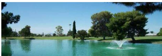
Palmbrook Country Club Golf Course

Fourth Annual Tee Off for Sight- 4 Person Scramble