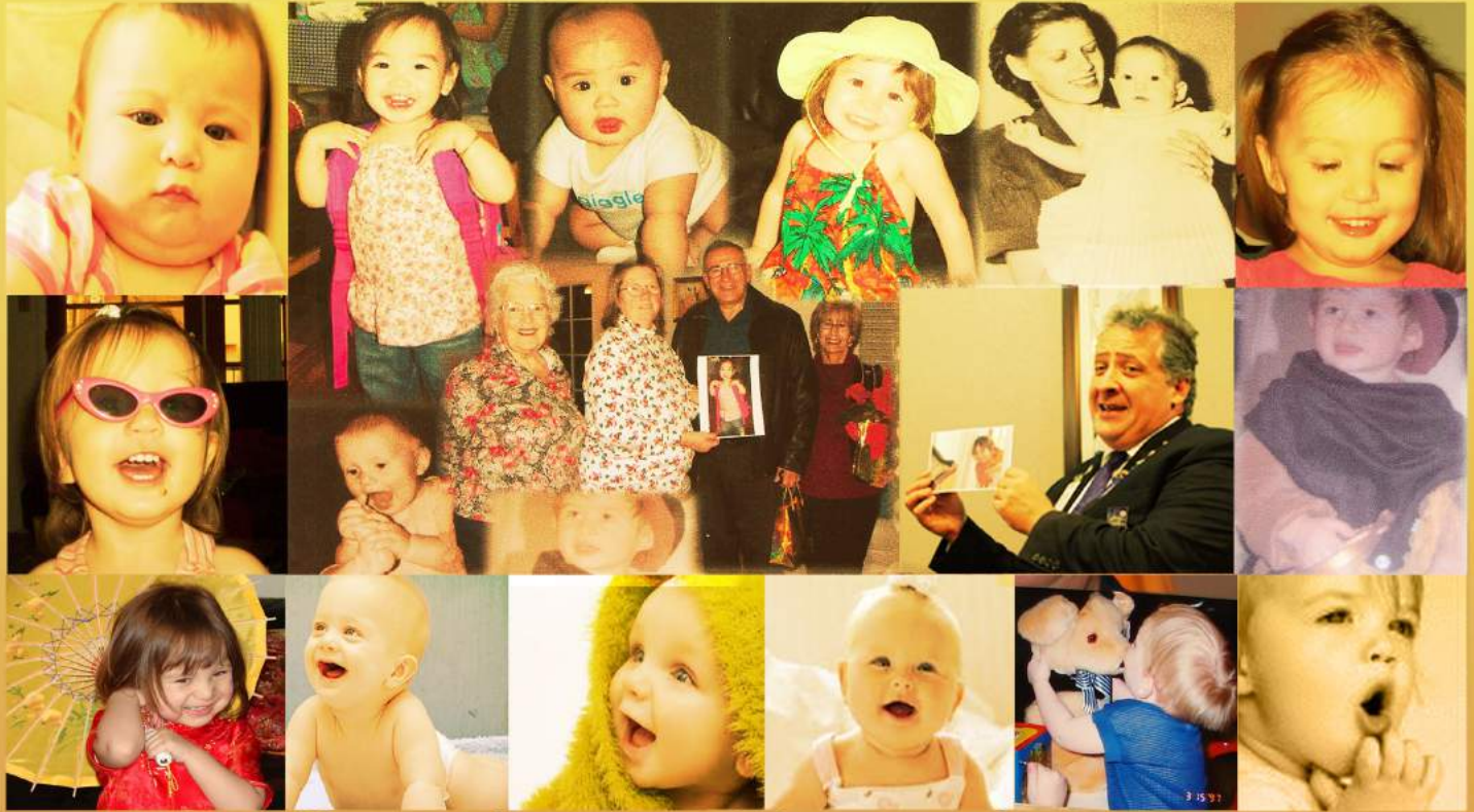
Photos of past participants and winners

Rules: Please enter any baby photo of a child 3 years of age and under. The photo can be old and the baby can be in a group photograph with the family members, etc... any baby photo can be entered.