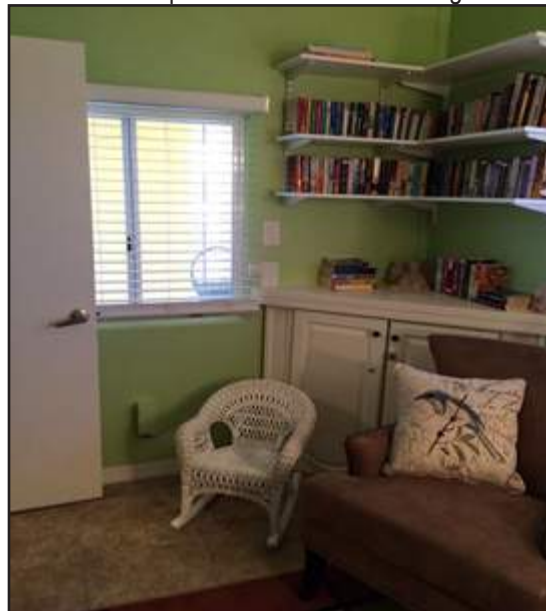
A quiet place