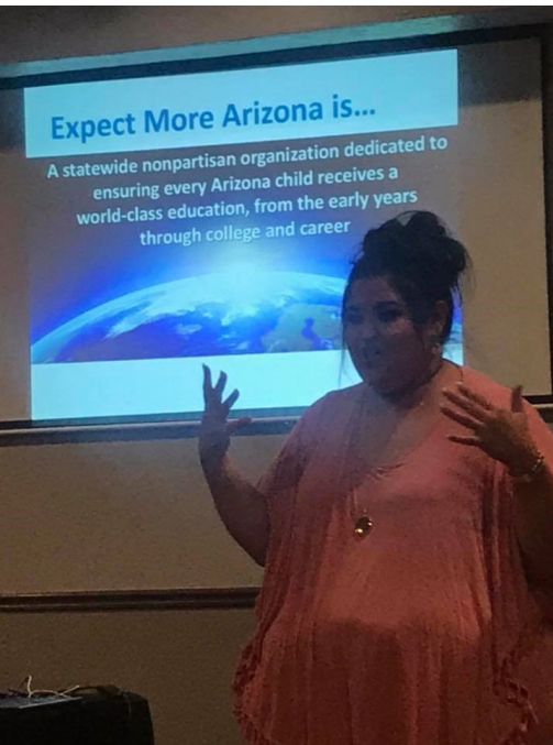
Expect More Arizona was guest of the Nogales LC.