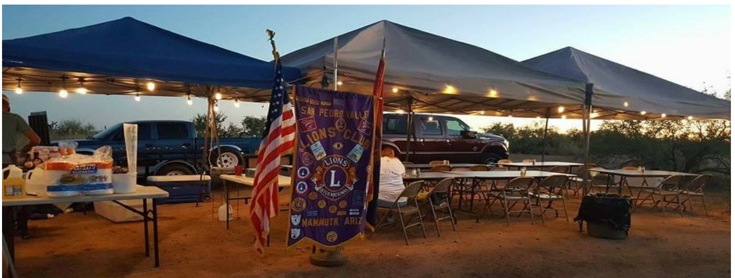
San Pedro Valley Lions Club from Mammoth, AZ hosted a breakfast for the early quail hunters.