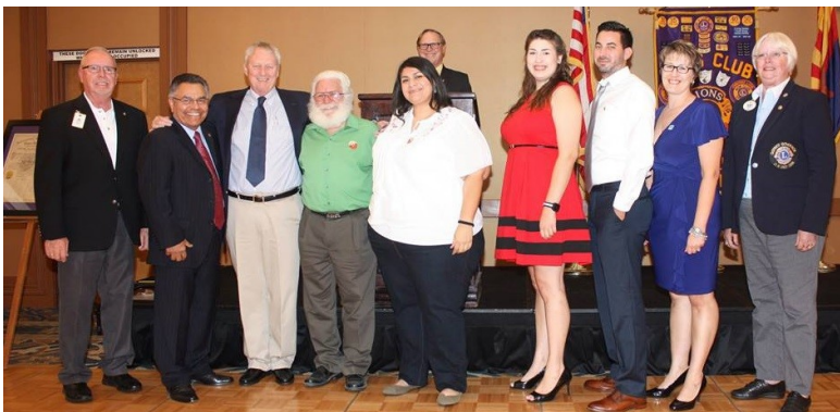
South Tucson LC recently formed a branch clubs with 8 members. Welcome Lions!!