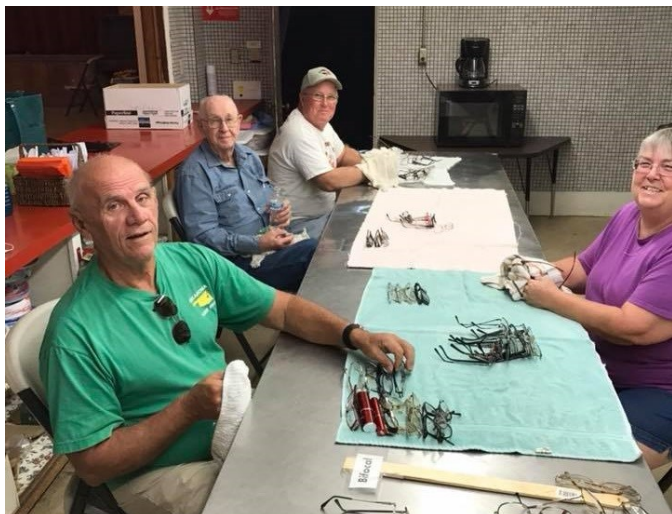
Globe Lions sort and clean eyeglasses for the Arizona Lions Eyeglass Recycling Terminal.