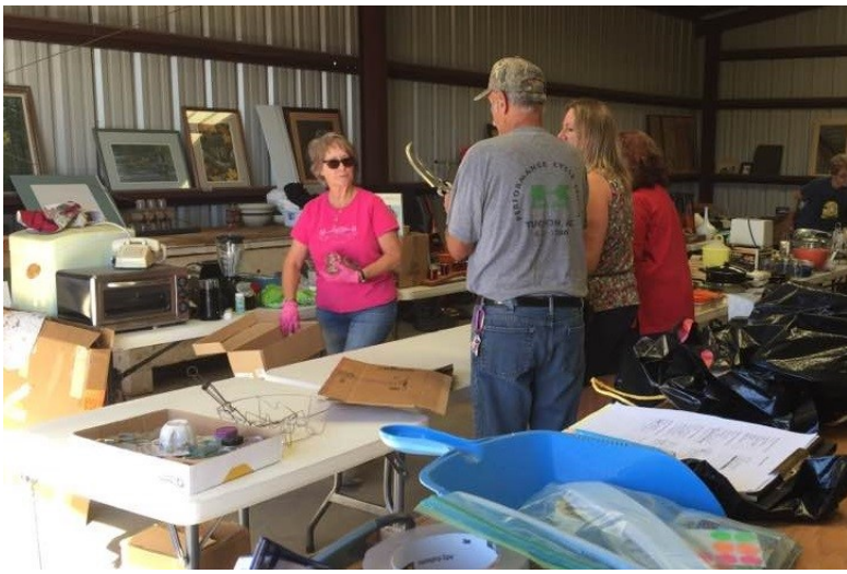
Cochise Stronghold Lions Club hosted a BIG BARN SALE in Pearce.