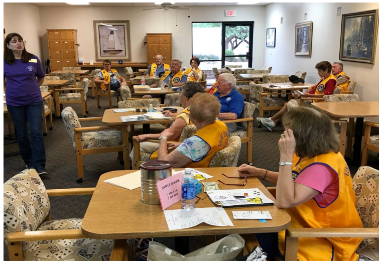
Mesa Sunland Springs hosted 5 trained pet, service, and therapy dogs from Paws 4 Life, located in Apache Junction.