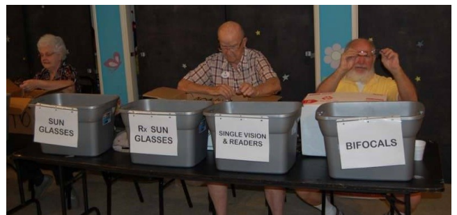
Tanque Verde Valley Lions sort eyeglasses for the Arizona Lions Eyeglass Recycling Terminal.