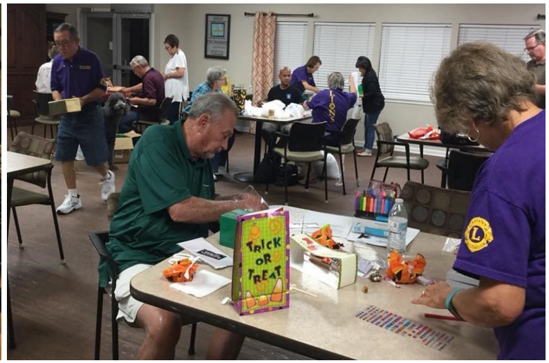
Chandler LC had a terrific time making Christmas gift bags for those in need.