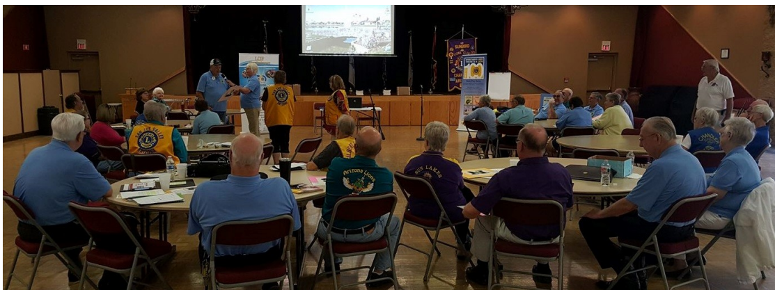
Lions listens attentively as a new member was inducted at the workshop.