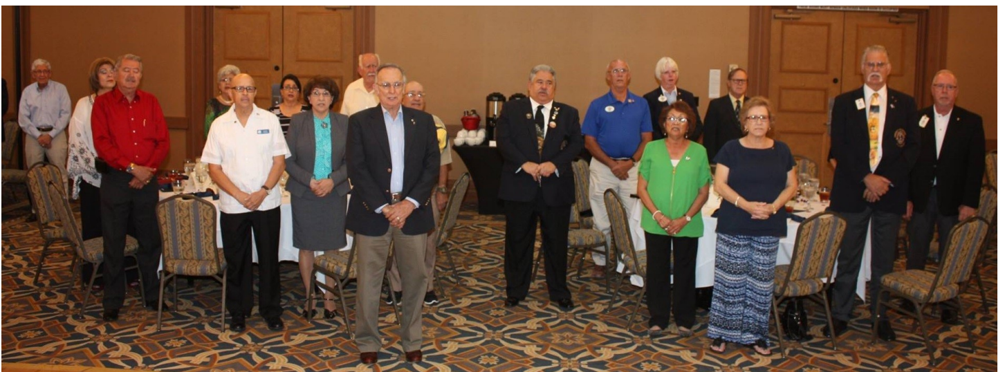
South Tucson Lions Club celebrated 70 years in Lionism in grand style. Congratulations!!