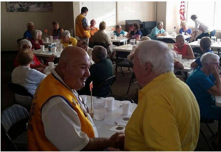
Mesa FOS hosted a pizza party to thank their non-Lions volunteer. Way to Go!!