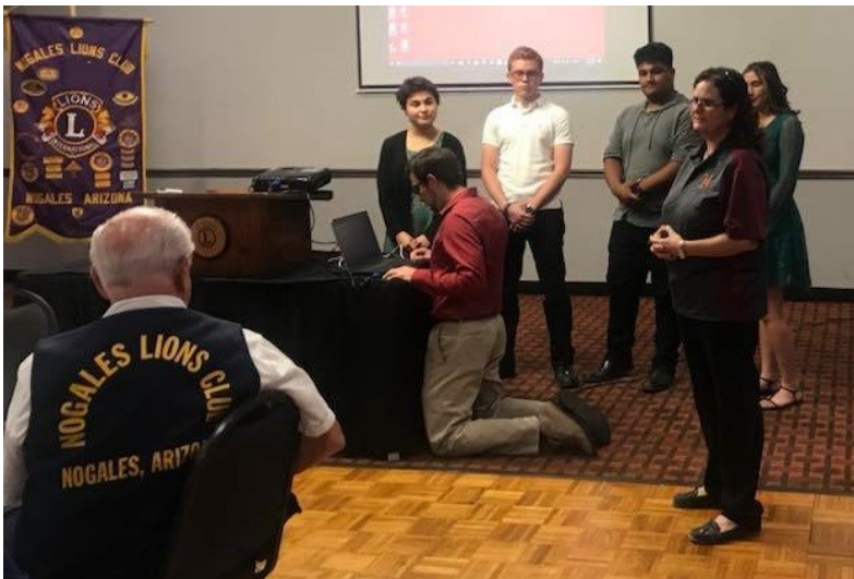
Nogales High School Leos Club were guests of their sponsor club; Nogales LC.