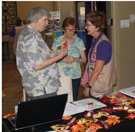
Catalina Oro-Valley LC hosted an information booth and Vision Screening Demonstration for Saddlebrooke residents.