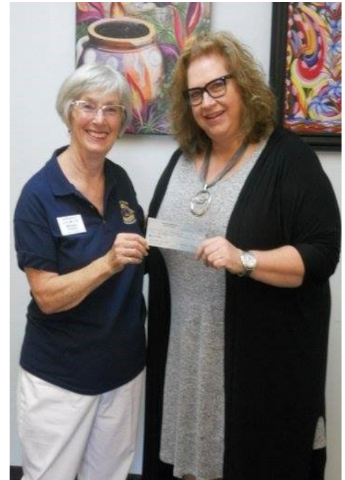
Maricopa Lions Club donated $500 to the Maricopa Food Bank. Kudos!!

Please download the logo from LCIs website www.lionsclubs.org