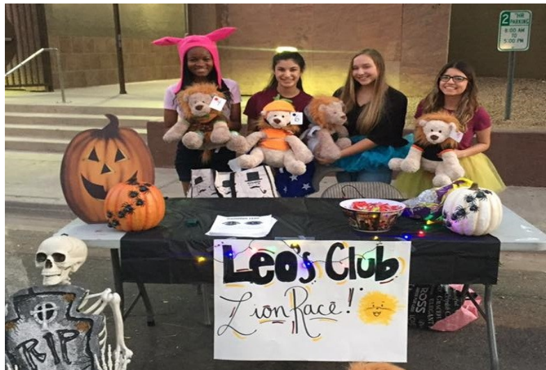
Hamilton High School Leo's Club played bingo with kids at the Downtown Chandler Spooktacular Festival and promoted volunteerism.