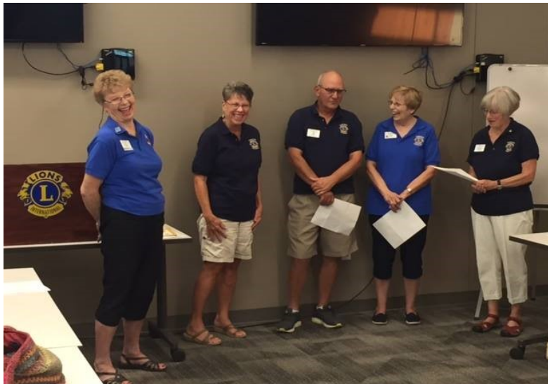
Maricopa Lions Club inducted a new member.