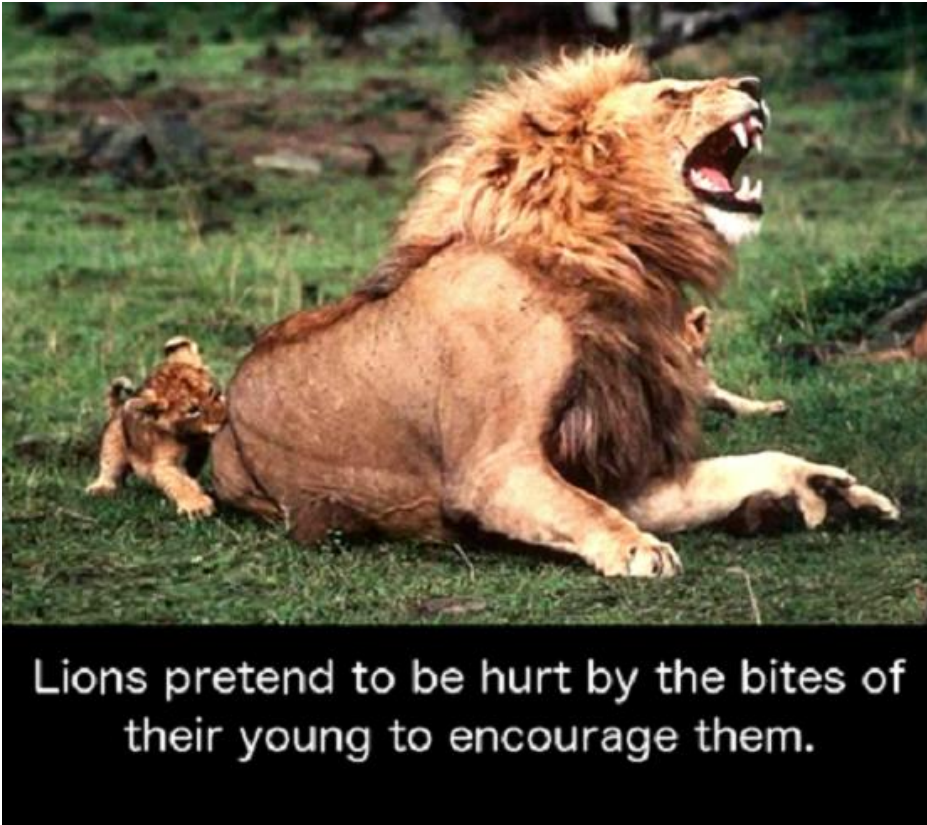
Lions pretend to be hurt by the bites of their young to encourage them.

Does this look or feel familiar? Well, as the picture says, Lions pretend to be hurt by the bites of their young to encourage them as hunters. But that is in the wild. Let's get to our reality. Lions, and I mean all of us who are members of clubs that belong to LCI – need to stop taking bites out of each other. The little nick-picking of what's right or what's wrong behind each other's backs is just so wrong on many levels. We Lions say WE SERVE..... but serve