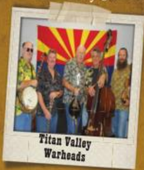
Titan Valley Warheads