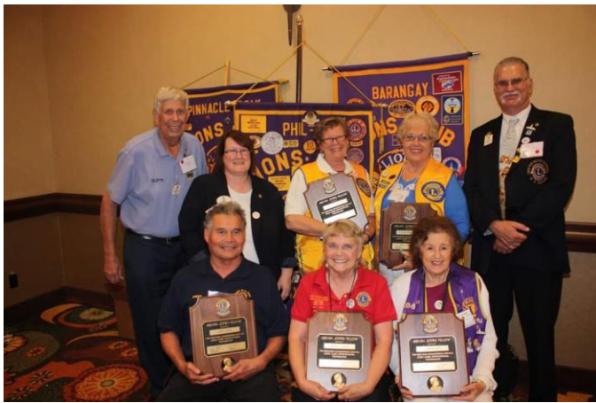
Five of the seven MJFs awarded in 21-B.

Two more will be awarded as soon as I can track them down and I'll let you know after they have been presented their plaque. I have to say that this was the highlight of my year – an amazing opportunity that we probably will never, ever see happen again.