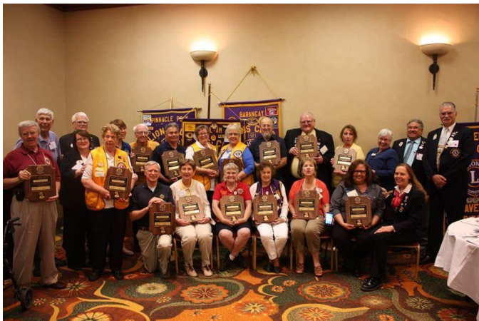
Sixteen of the 21 MJFs awarded in MD21