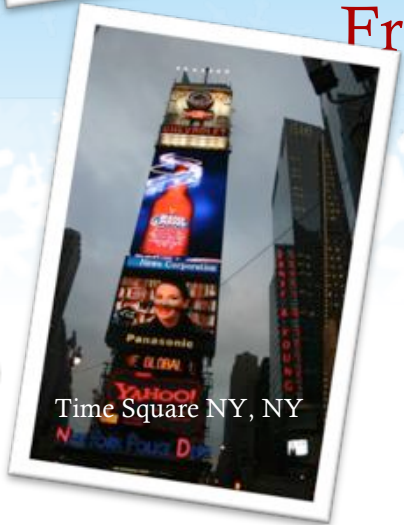
Time Square NY, NY

From the Management and Staff at The District A-5 Newsletter