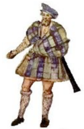
Earliest Illustration of a Belted Plaid

There is quite the history of the Scottish Kilt and many claims and misconceptions. It is now the national Dress of Scotland with different tartans representing different Clans. And to avoid entering the fray, we will leave it at that.