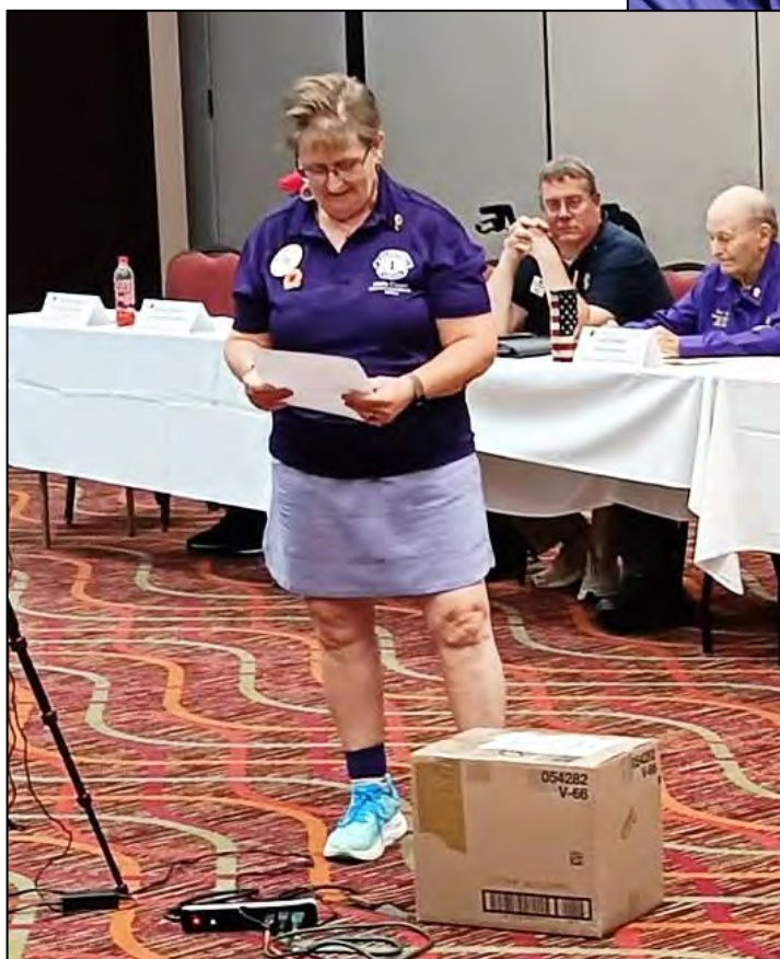
Our District Governor Aleta Cozart was named "Tail Twister" of the Council of Governors at their meeting on August 1, 2025.