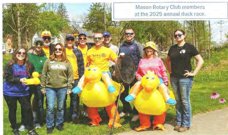
Mason Rotary Club members at the 2025 annual duck race.

For anyone feeling isolated or searching for a way to get more involved, attending a local service club meeting can be a simple but powerful first step. These gatherings are welcoming spaces where all are invited to contribute, learn, and belong.