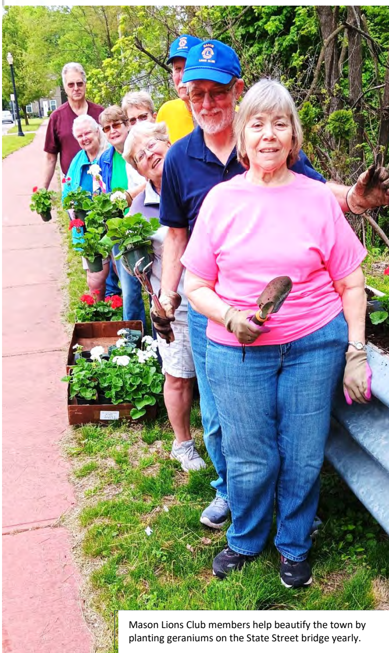
Mason Lions Club members help beautify the town by planting geraniums on the State Street bridge yearly.