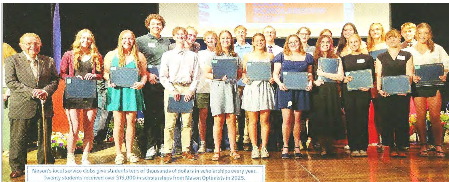
Mason's local service clubs give students tens of thousands of dollars in scholarships every year. Twenty students received over $15,000 in scholarships from Mason Optimists in 2025.