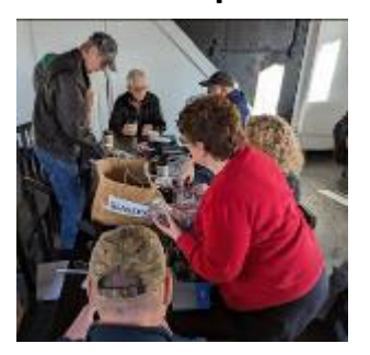
Eaton Rapids Lions learn about the Lions Eyeglass Recycling project and expanded their collection to almost 20 locations at their March 6th meeting.