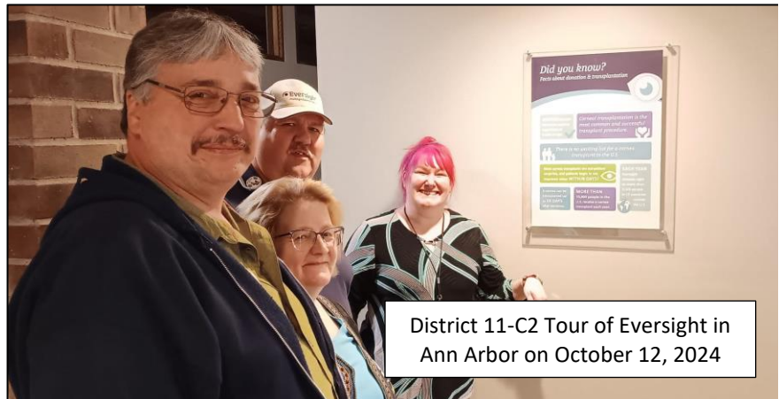
District 11-C2 Tour of Eversight in Ann Arbor on October 12, 2024

I am still looking for more Clubs to join in on the contest we're running for a Melvin Jones Fellowship award. Each Club need only contribute $100 to the District to participate. We have several Clubs signed up, but we need more. See the flyer later in this newsletter for details. I'm still visiting more of our Clubs. If I've not visited yours yet, please get ahold of me soon to get scheduled. I hope everybody has a Happy Thanksgiving!