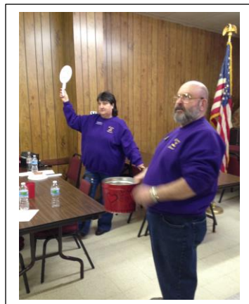
2015 District "Fun"draiser!