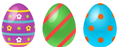
photo with the Easter Bunny

Sponsored by St. Johns Lions Club with the support of the City of St. Johns and local businesses and groups