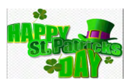
March 17, 2020