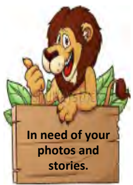
March 8, 2020