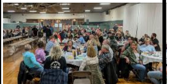
A Great crowd assembled for the 15th annual Gratiot Lions Tractor race!

The 4 Lions Clubs in Gratiot County (Alma/St. Louis, Ithaca, Ashley, and Maple Valley) held their 15th annual Tractor race on February 18th at PINS in Ithaca. Over 240 individuals from 24 businesses and Lions Clubs enjoyed a catered meal and a night of fun and fellowship as we raised around $8,000 for Lions projects in our communities.