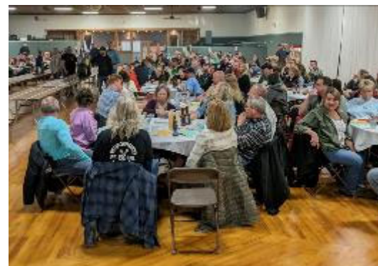
A Great crowd assembled for the 15th annual Gratiot Lions Tractor race!

The 4 Lions Clubs in Gratiot County (Alma/St. Louis, Ithaca, Ashley, and Maple Valley) held their 15th annual Tractor race on February 18th at PINS in Ithaca. Over 240 individuals from 24 businesses and Lions Clubs enjoyed a catered meal and a night of fun and fellowship as we raised around $8,000 for Lions projects in our communities.