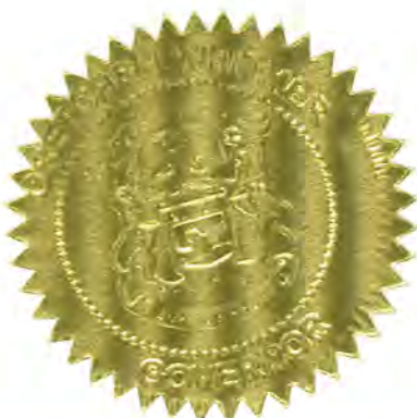
Gretchen Whitmer Governor